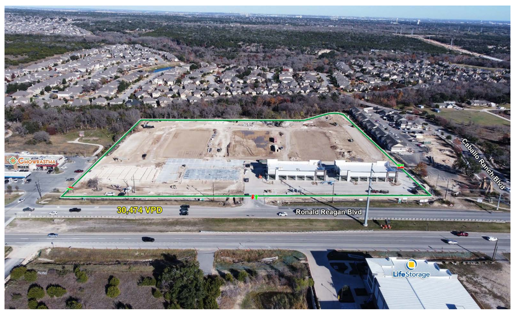
CONSTRUCTION PROGRESSION AS OF DEC 2023

The information contained herein was obtained from sources deemed reliable; however, RESOLUT RE makes no guaranties, warranties or representations to the completeness or accuracy thereof. The presentation of this real estate information is subject to errors; omissions; change of price; prior sale or lease; or withdrawal without notice. RESOLUT RE, which provides real estate brokerage services, is a division of Reliance Retail, LLC, a Texas Limited Liability Company.