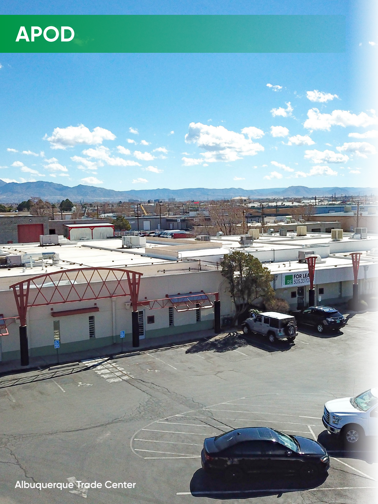
Albuquerque Trade Center