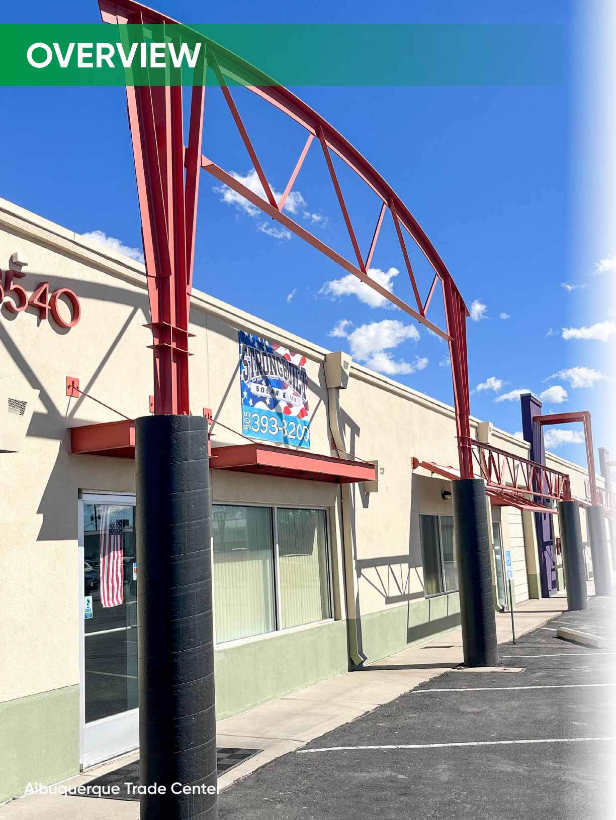
Albuquerque Trade Center