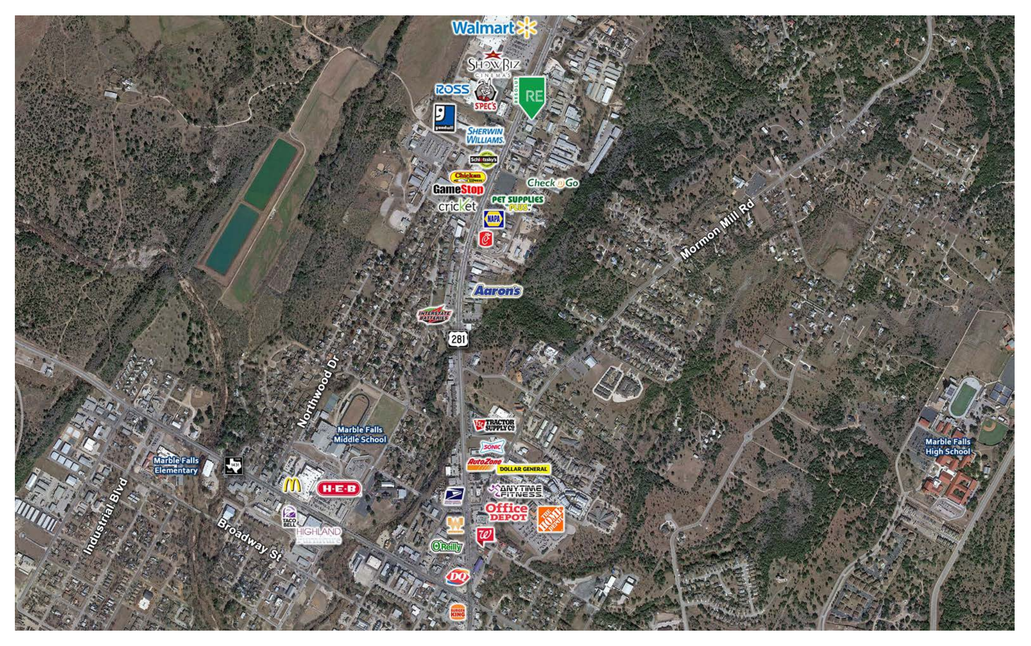
The information contained herein was obtained from sources deemed reliable; however, RESOLUT RE makes no guaranties, warranties or representations to the completeness or accuracy thereof. The presentation of this real estate information is subject to errors; omissions; change of price; prior sale or lease; or withdrawal without notice. RESOLUT RE, which provides real estate brokerage services, is a division of Reliance Retail, LLC, a Texas Limited Liability Company.