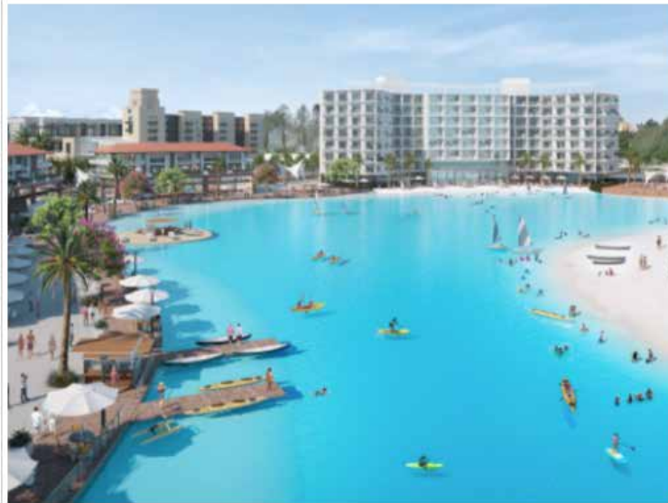
The Austin area is getting a crystal lagoon. Courtesy rendering

A massive new development is underway in the Austin area, promising retail, restaurants, entertainment, a hotel, office and residential space, and 4-acre crystalline lagoon.