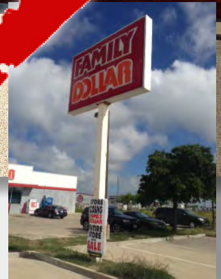
not subject property